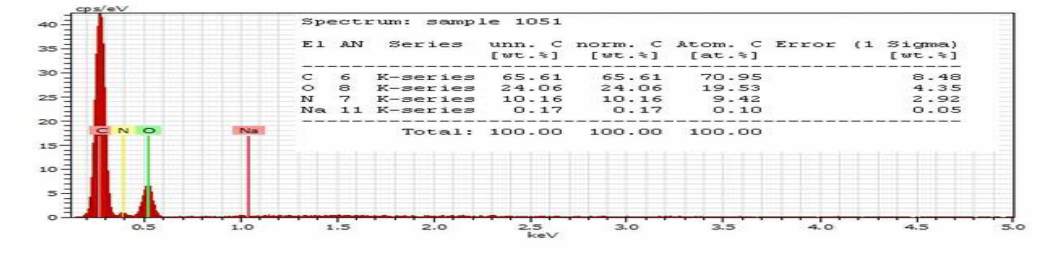
Fig.2.EDAX spectra of LTSN crystal

The UV-vis-NIR transmission spectrum (Fig.3) has been recorded using Lamda-35 UV-vis-NIR spectrophotometer in the wavelength range of 190-1100nm. From the spectrum the cut-off wavelength of LTSN