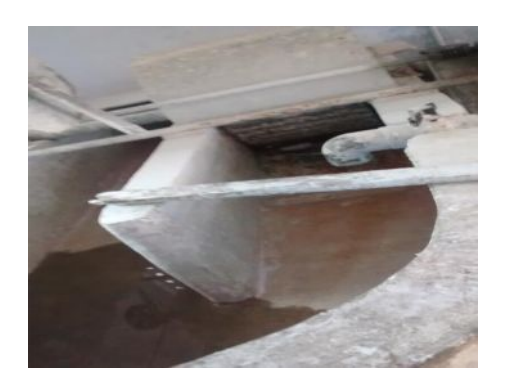
Fig 2: Beater