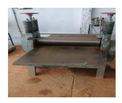
Fig 4: calendaring