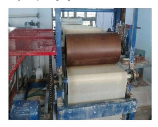
Fig 3: paper making machine