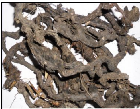
Fig.3: Cyperus rotundus herb