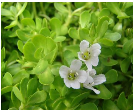
Fig. 2: Bacopa monnieri herb

Alkaloids (Phyllantidine, Phyllantine), Vitamin C, Gallotannis (5%), Carbohydrates (14%), Pectin, Minerals, Phenolic acid, Gallic acid, Ellagic acid, Phyllemblic acid, Emblicol, Amino acid ( Alanine, Aspartic acid, Glutamic acid, Lysine, Proline) 9 . Gupta et al investigated increase in hair growth activity of Emblica officinalis .