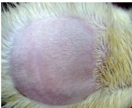
Fig. 6: Hair growth at 10 th day with HF2