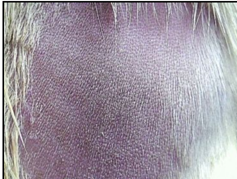
Fig. 5: Hair growth initiation at 6 th day with HF2.