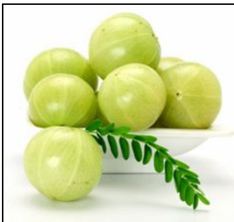
Fig. 1: Emblica officinalis fruits

Emblica officinalis is rich in vitamin C, tannins and minerals such as phosphorus, iron and calcium which provides nutrition to hair and also causes darkening of hair 11,14 in Fig.1 Part Used: Fruit.