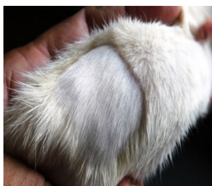
Fig. 7: Hair growth at 20 th day with HF2