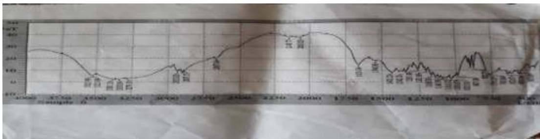
(c) Figure-(a)FTIR of Polysaccharide,(b)Isoniazid and (c)mixture of drug and excipients