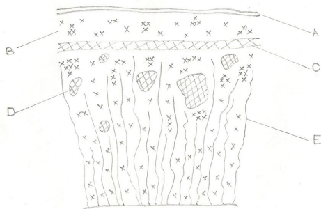
Figure 1. Schematic diagram, TS of the stem bark

The transverse sections (TS) of stem bark were obtained by usual techniques. [5] Good sections were collected and placed on a grease free microscopic slide along with a drop of glycerin water (1:1). The sections were covered with clean cover slip and observed under the compound microscope at 40x magnification. A camera lucida was attached with the microscope and the sections were suitably traced out. [6]