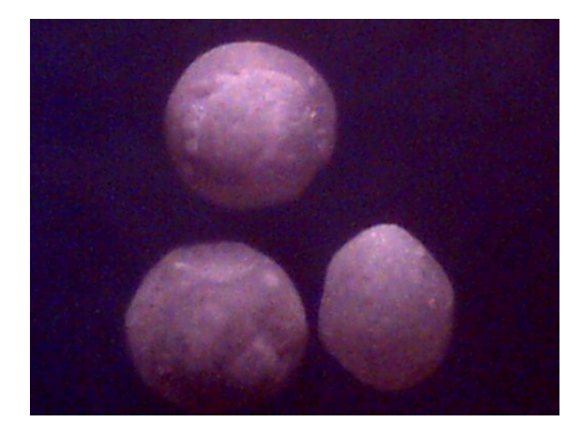
Fig. 2: Photomicrograph of ethyl cellulose coated microcapsules, Magnification 200x.