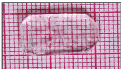
Fig. 1. Photograph of 0.4 % L-tryptophan doped KDP crystal.

The doping of L-tryptophan into KDP was achieved by adding 0.3 wt. % and 0.4 wt. % of L-tryptophan in KDP solution prepared in double distilled water. The growth of pure and L-tryptophan doped KDP crystals were obtained by slow solvent evaporation method. The good quality and transparent were within 8 to 10 days. Figure-1 shows a photograph of 0.4 % L-tryptophan doped KDP crystal.