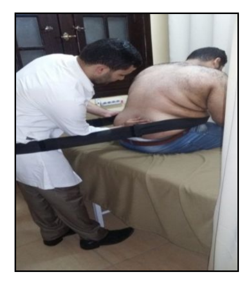
Fig (1) starting position of MWM

Position of patient : The patient was sitting on a plinth with his legs over the side. The therapist sanded behind him and placed a belt around his lower abdomen keeping it below the anterior superior iliac spine for comfort. The belt should be below therapist hip joints for more stabilization and comfort. The ulner border of therapist's one hand is placed under the spinous process of the vertebra above at the suspected spinal segment. Therapist's other hand was placed on the bed to thimnbe side of the patient for more stabilization. The therapist applied a gliding force with his right hand up along the treatment plane which is 90° in the horizontal plane( the angles of inclination of the facet joints in the horizontal plane is 90° for the lumbar spine) as the patient was flexing forward,. The therapist maintained the facet glide until the patient was erect again. This technique was repeated ten times/session<sup>5</sup>.