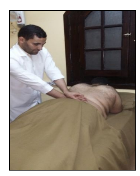
Fig (2):Postero-Anterior mobilization for lower lumbar region