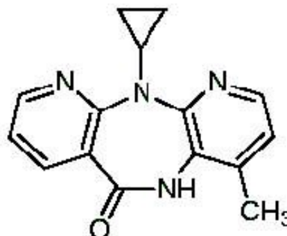
Fig: 1 Structure of nevirapine

Literature survey further revealed that there are very few reported HPLC method for the analysis of nevirapine alone in human plasma. The methods reported include HPLC with fluorescence detection or with ion pairing, HPLC with mass detection or with LCMS-MS analysis, although such detector systems may not be available in most laboratories.